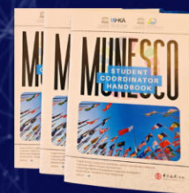
Lesson Notes Included