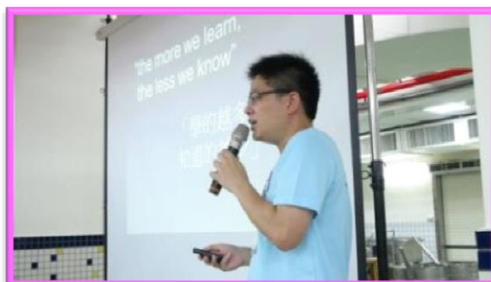
Long way to go - Sustaining our oceans