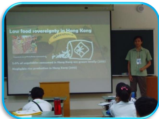
“Eco friendly diets and food sovereignty in Hong Kong” St. Paul’s College