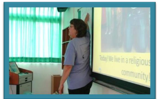
Living in a religious diverse world