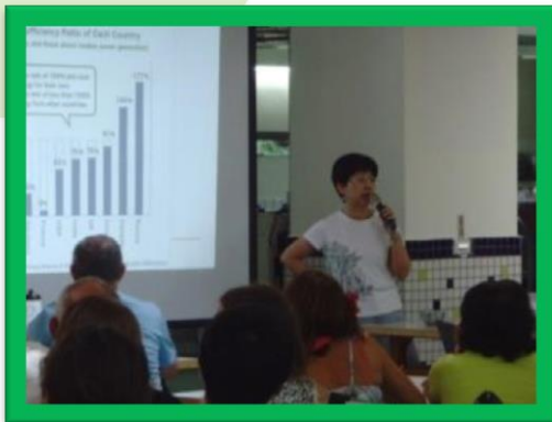
Energy saving in Taiwan